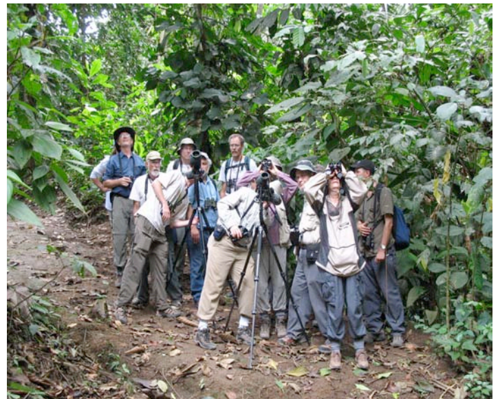
Birding MCF's Rio Silanche Reserve