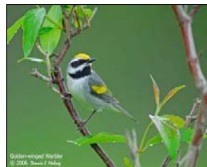
Golden-winged Warbler, photo by Dennis Malueg