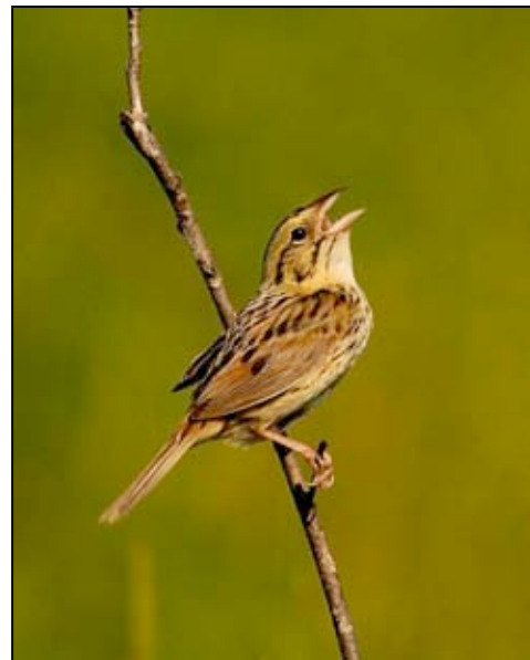
Henslow's Sparrow