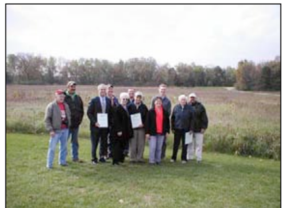
Pine Island dedication group