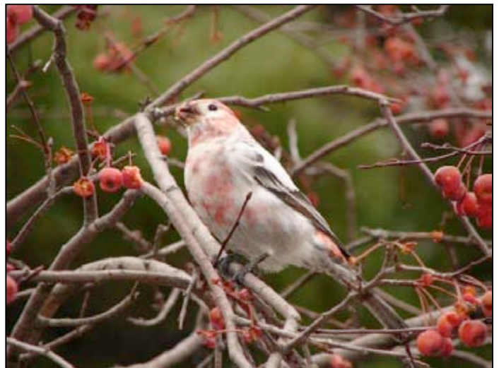
Albino Pine Grosbeak, photo by Susie Fox, Spread Eagle

The Natural Resources Foundation (NRF) is a nonprofit organization that creates opportunities for individuals and organizations who care about Wisconsin's lands, waters, and wildlife to: deepen their understanding and appreciation for these resources; support state and local conservation programs; and create conservation endowments. For more information on NRF, visit www.wisconservation.org or call (866) 264-4096.