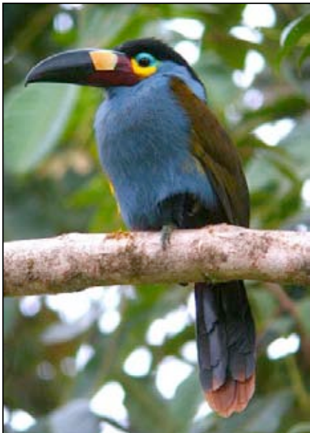
Plate-billed Mountain Toucan

Interested in immersing yourself in Latin America culture, having more fun than you thought possible and seeing more great birds than you can shake a stick at, all while supporting conservation of important bird habitat? There may be a tropical birdathon in your future! If you’d like more information, contact Craig Thompson at Craig.Thompson@wisconsin.org .