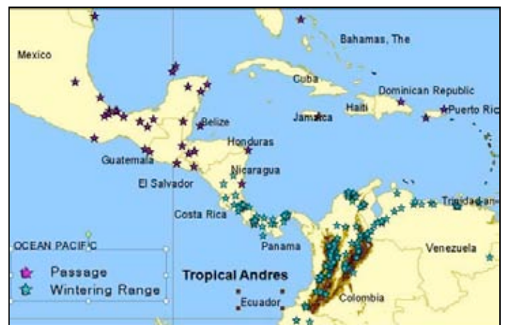
Golden-winged Warbler wintering range