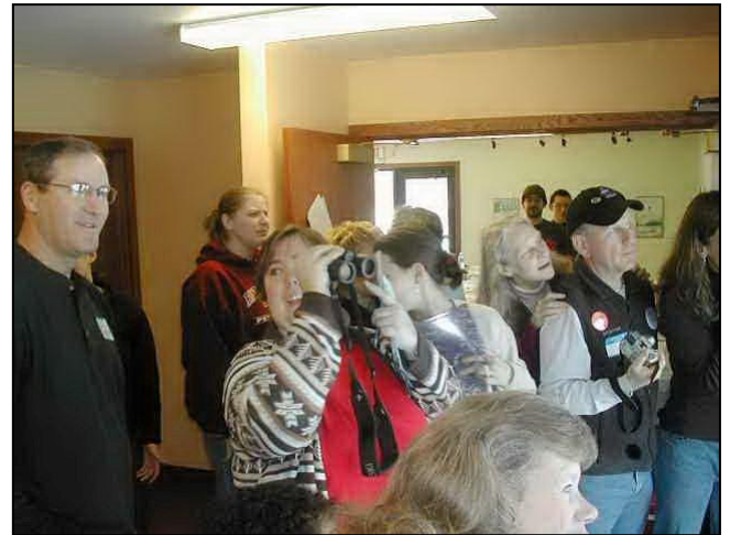
Flying Wild participants