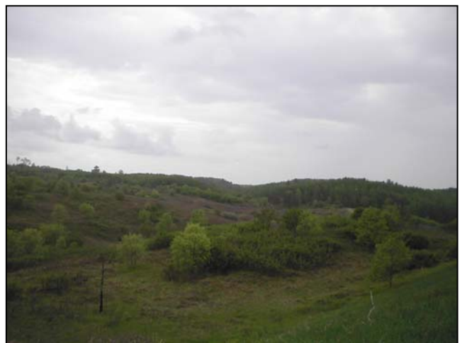
Spread Eagle Barrens