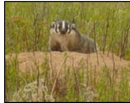
Badger at SEB

Spread Eagle Barrens is owned by the Wisconsin Department of Natural Resources and We Energies and is managed to restore and maintain the barrens/grassland communities. We Energies recently committed to a 3-year pledge of financial support for management of Spread Eagle Barrens through the Natural Resources Foundation's Adopt-a-State-Natural-Area Program. Barrens communities require regular disturbance, typically fire, to maintain their open character. Managers at Spread Eagle use a variety of techniques, including prescribed burns, hand-cutting and chemical treatment of stumps, and restoration timber sales, to control invasive species and woody encroachment. These activities will maintain and enhance habitat for shrub and grassland birds, many of which are considered to be of conservation concern. Visitors can find maps, a Spread Eagle Barrens exhibit, and other information at the Wild Rivers Interpretive Center in Florence. Spread Eagle Barrens was officially dedicated on June 2 nd , 2007 at a ceremony at the scenic LePage Creek Overlook. It is Wisconsin's 50 th IBA.