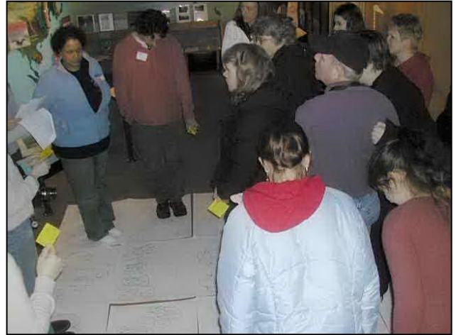
Flying Wild participants