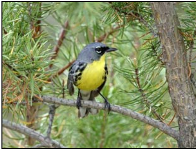
Kirtland's Warbler